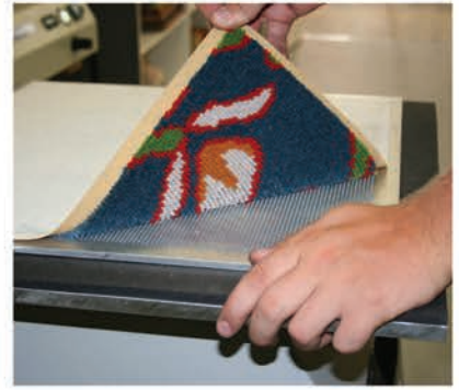
Minutes later the sample is complete!