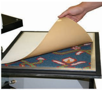
Apply hotmelt to the sample