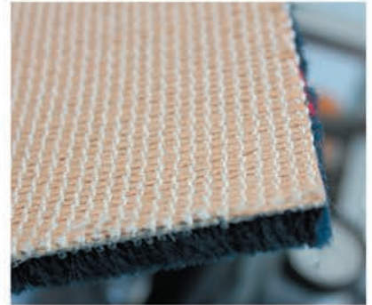
Use clear backing with your own secondary backing