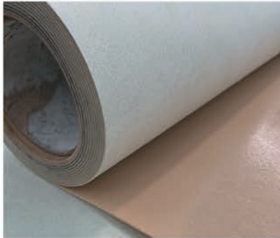
Lined hotmelt (with poly) backing