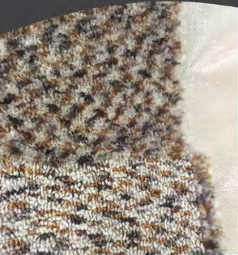
Space dye singles from the Mtuft Mini