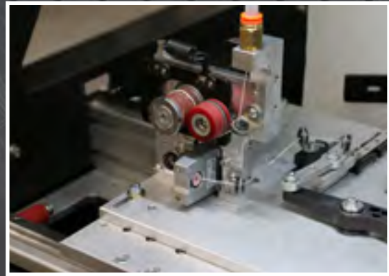
The yarn feed system incorporates an electronic yarn detection system allowing the machine to run unattended.