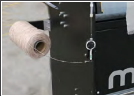
A package of yarn is fitted to the machine. Singles, Air Entangled or Heat Set yarn can be used to produce Cut or Loop