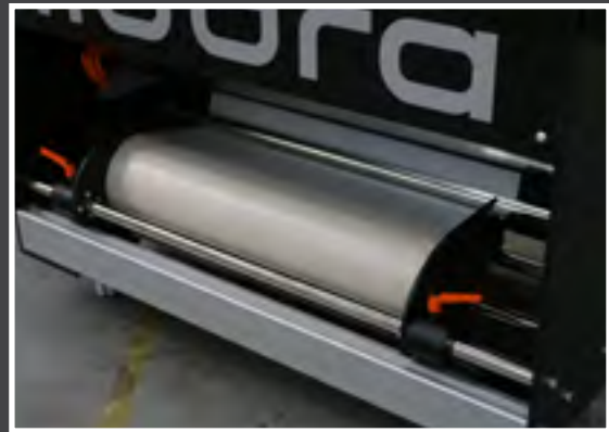
The primary backing roll is fitted into the machine with quick change side guides.