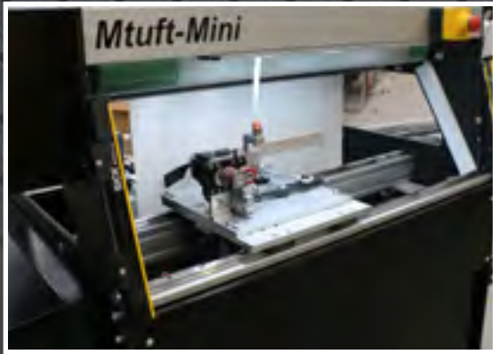
Vertical Primary backing means easy viewing of the sample, and quick needle stroke adjustments.