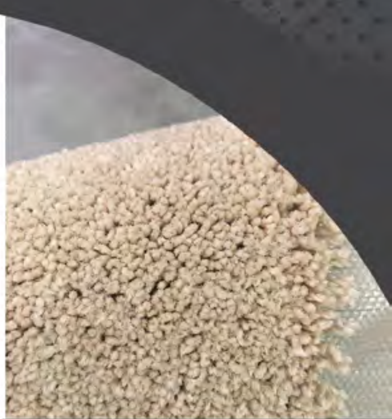
Cut pile heat set yarn from the Mtuft Mini